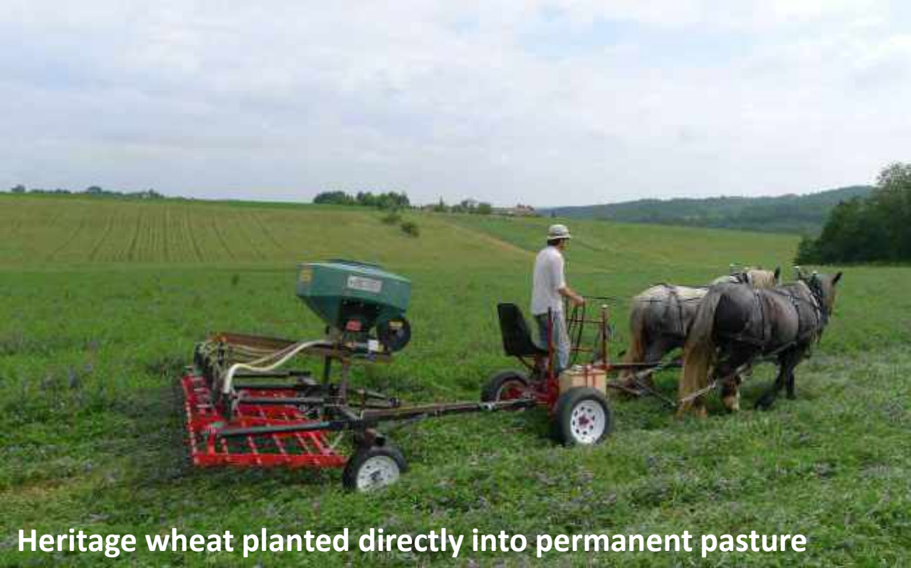
Heritage wheat planted directly into permanent pasture