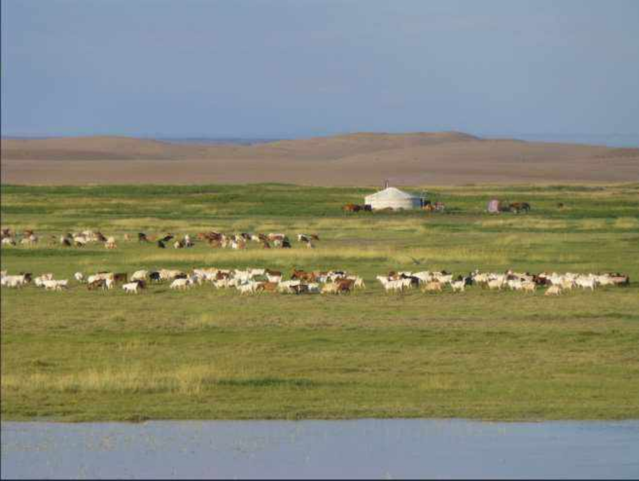
The pastures of Mongolia