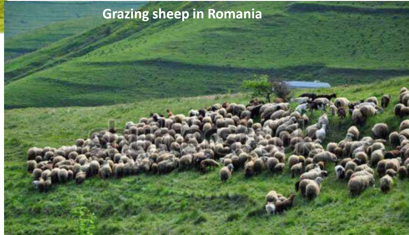
Grazing sheep in Romania