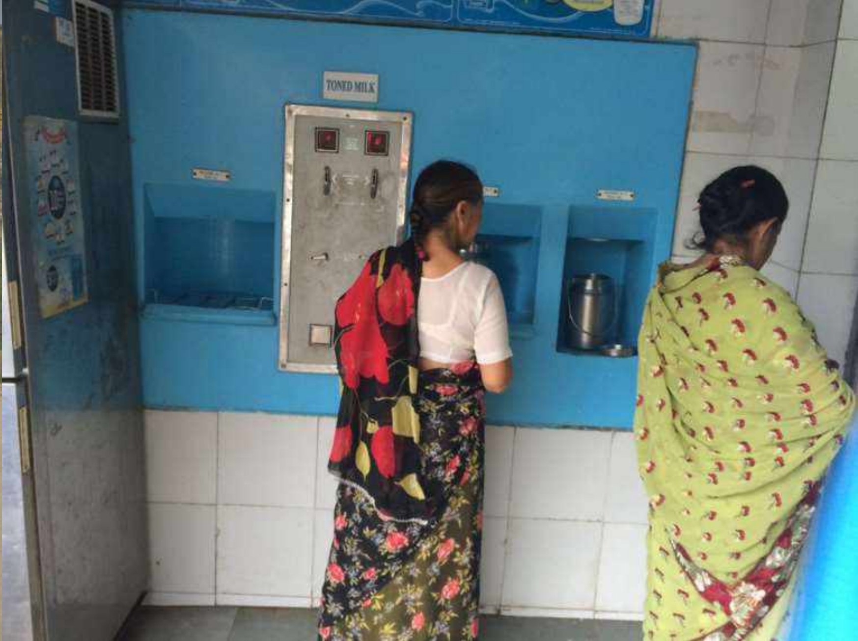
Milk Vending machine in shopping mall in central Delhi