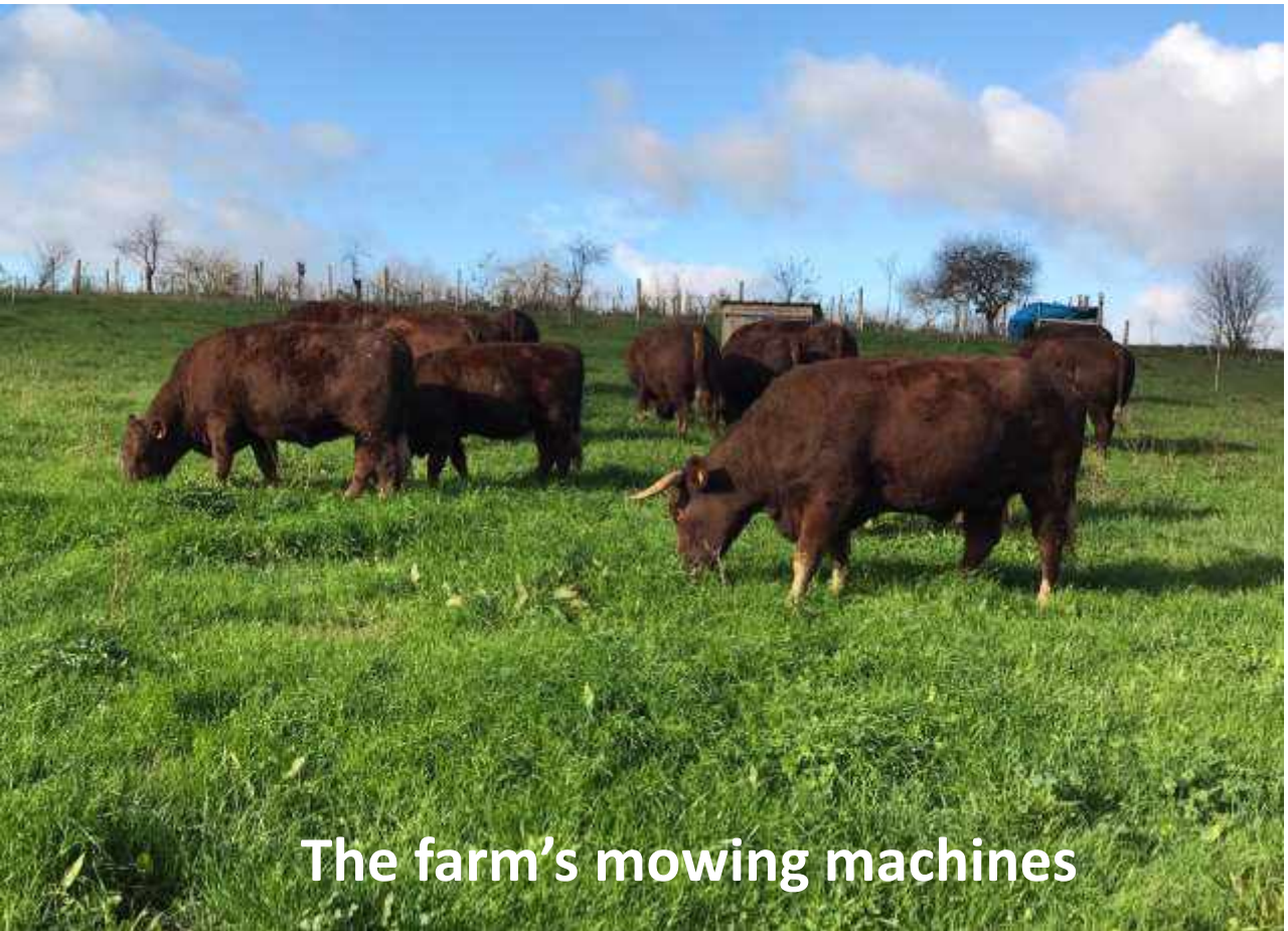
The farm at Naroques – southern France