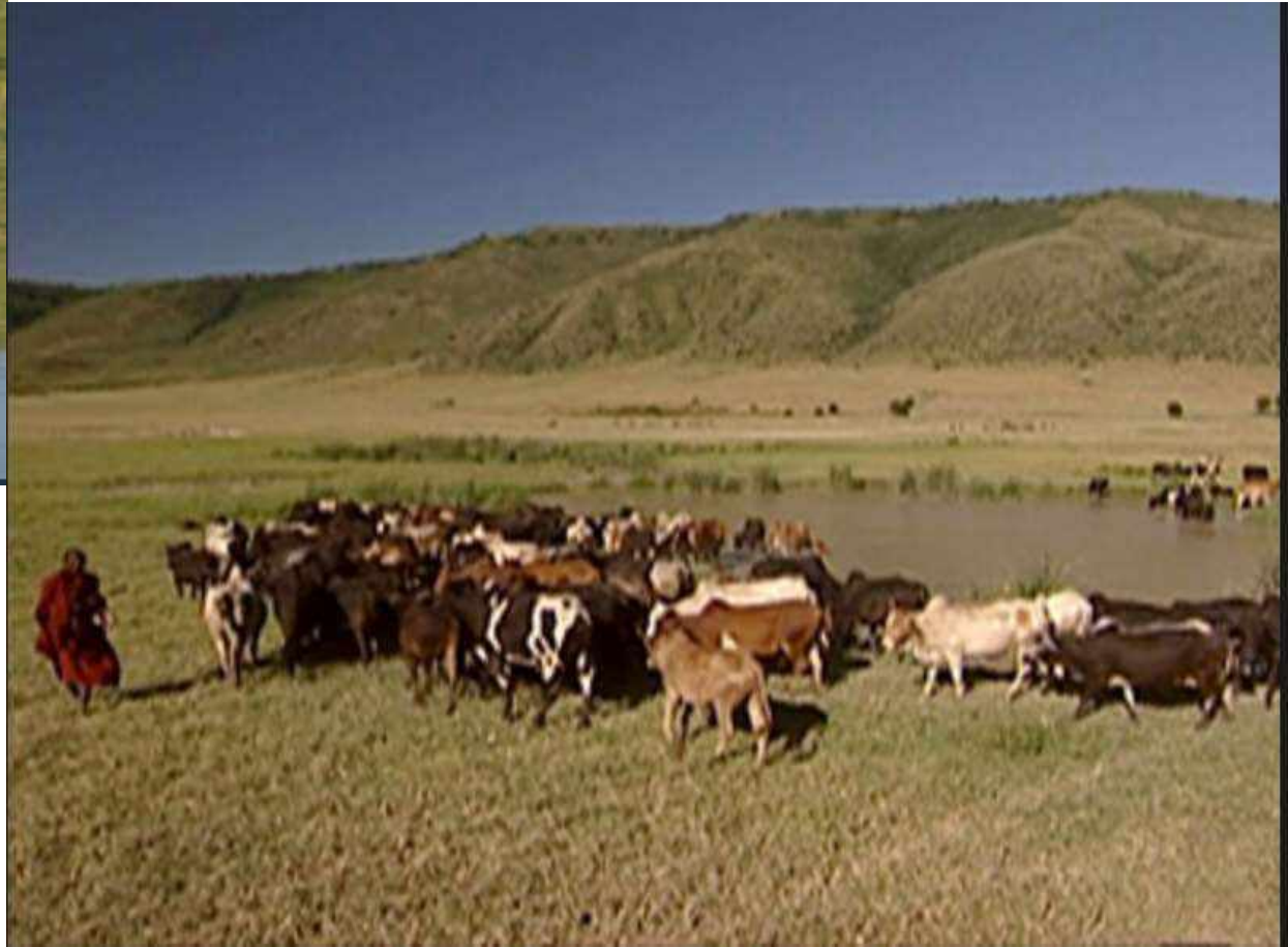
The Maasai in East Africa