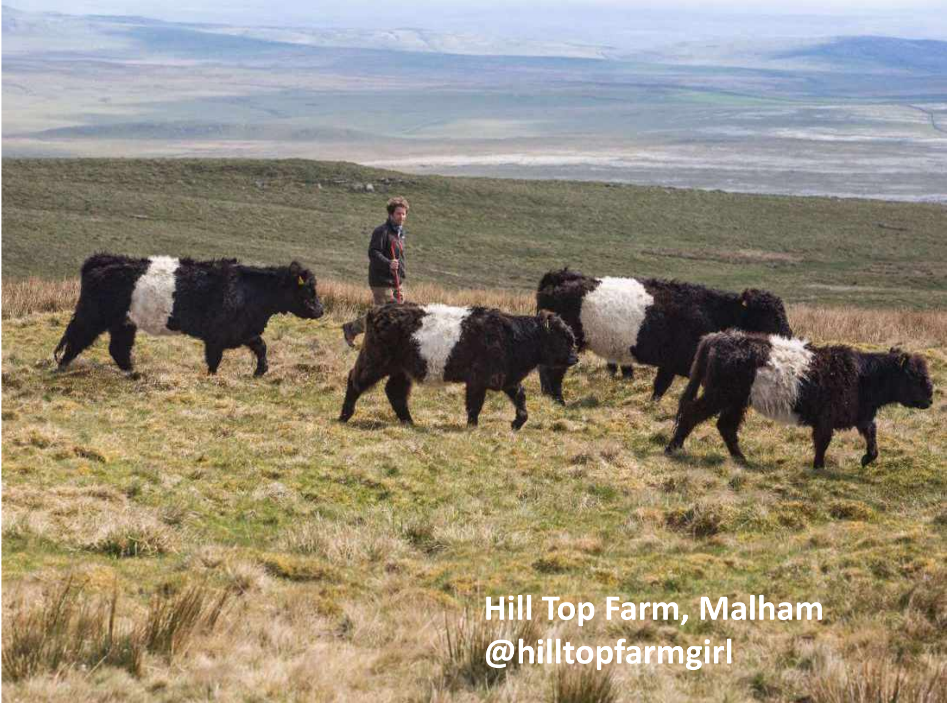
Hill Top Farm, Malham @hilltopfarmgirl