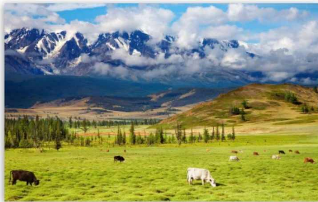
Grazing cattle in Argentina