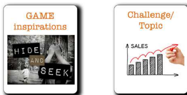
Figure 1: Example cards for the Remixing Play flash game (Arnab, 2019b)

Remixing Play consists of repurposing existing games or playful activities into new playful solutions. Figure 1 shows an example of a simple Remixing Play concept (the Flash Game version) that is used to nudge participants to rapidly and playfully construct a playful concept in a brief period. This agile and playful approach helps to nudge them to realise their ability, what they care about (motivation) using simple prompts and triggers, in this case, the two cards showing (1) game/play Inspirations and (2) Challenge/Topic. The “behaviour” that we are expecting to be nurtured is the sustained practice of playful and creative thinking – a “brain-worm” that will nudge participants to continually/automatically think about playful solutions for problems, needs, challenges and opportunities that you see in your day to day living (Arnab et al, 2019b).