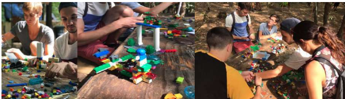
Figure 4. Participants of the Trial run of the playful LEGO session in Hungary

This part of the onboarding is to discover the reception of playful methodologies when engaging with real stakeholders within the farming environment. The playful LEGO session was delivered as a half-day workshop at the Gyüttment Farmers Festival in Hungary. The session was open and available to attend for all interested members of the public who attended the festival.