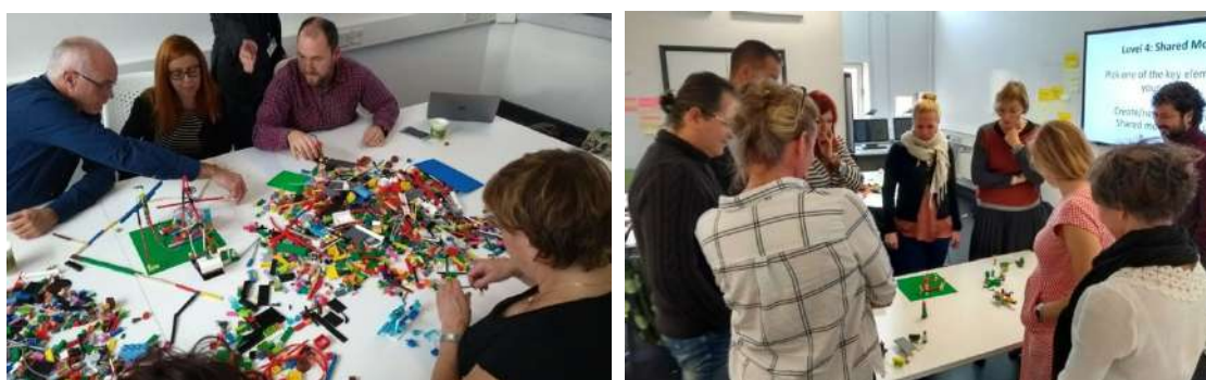
Figure 2: Partners onboarded into the use of LEGO blocks for breaking barriers to team communication and decision making

The partners regularly engage with farming stakeholders and in policy design. It is crucial for them to be onboarded into the understanding the value of playful approaches in their context. Workshops were organised to demonstrate the value of playful methods as powerful means for creative and inclusive team bonding, negotiations, and decision-making. The project partners were taken through the simplified LSP-inspired workshop in which they were asked to identify potential issues for the BOND project and to then develop shared strategies to minimise any impact from those issues.