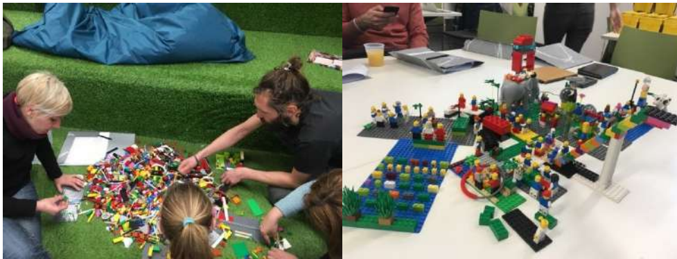
Figure 5: The LEGO Session with the Champions – from identification of challenges through to shared decisions

Nine 'Champions' were selected to represent the farming communities in the various countries in Europe to receive face-to-face training in Coventry University for both the playful LEGO and the Remixing Play approaches. The LEGO session facilitated the identification of context to the challenges in their sector, leading to a shared understanding of what the solutions could be. These insights were then used to inspire the Remixing Play activities, where the champions worked in teams to develop playful solutions to the challenges.